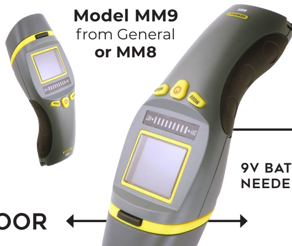
Model MM9 from General or MM8

Turn device upside down, push yellow center button to turn it on, and move it along floor as shown (press down firmly against floor surface).